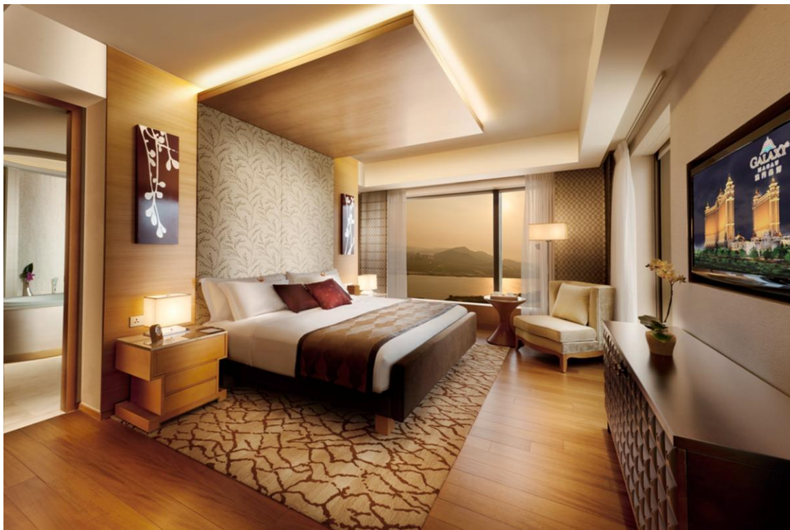
Hotel Okura Macau