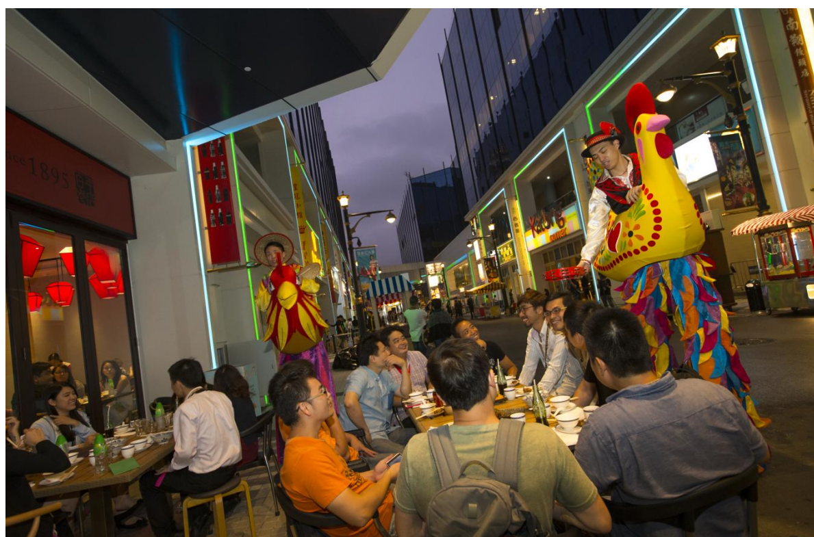
The Broadway in Broadway Macau™