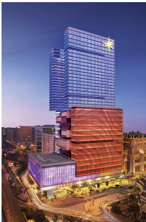
Outlook of StarWorld Hotel