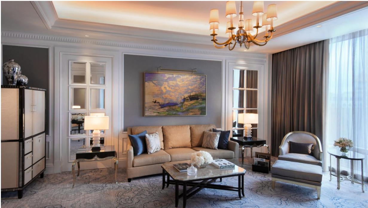
The Ritz-Carlton Macau

K. Wah Group Celebrates 60th Anniversary with Fabulous Prizes Sponsored by Galaxy Entertainment Group A 60-Day Quiz Contest to Win 60 Macau Luxury Accommodation 23 December 2015