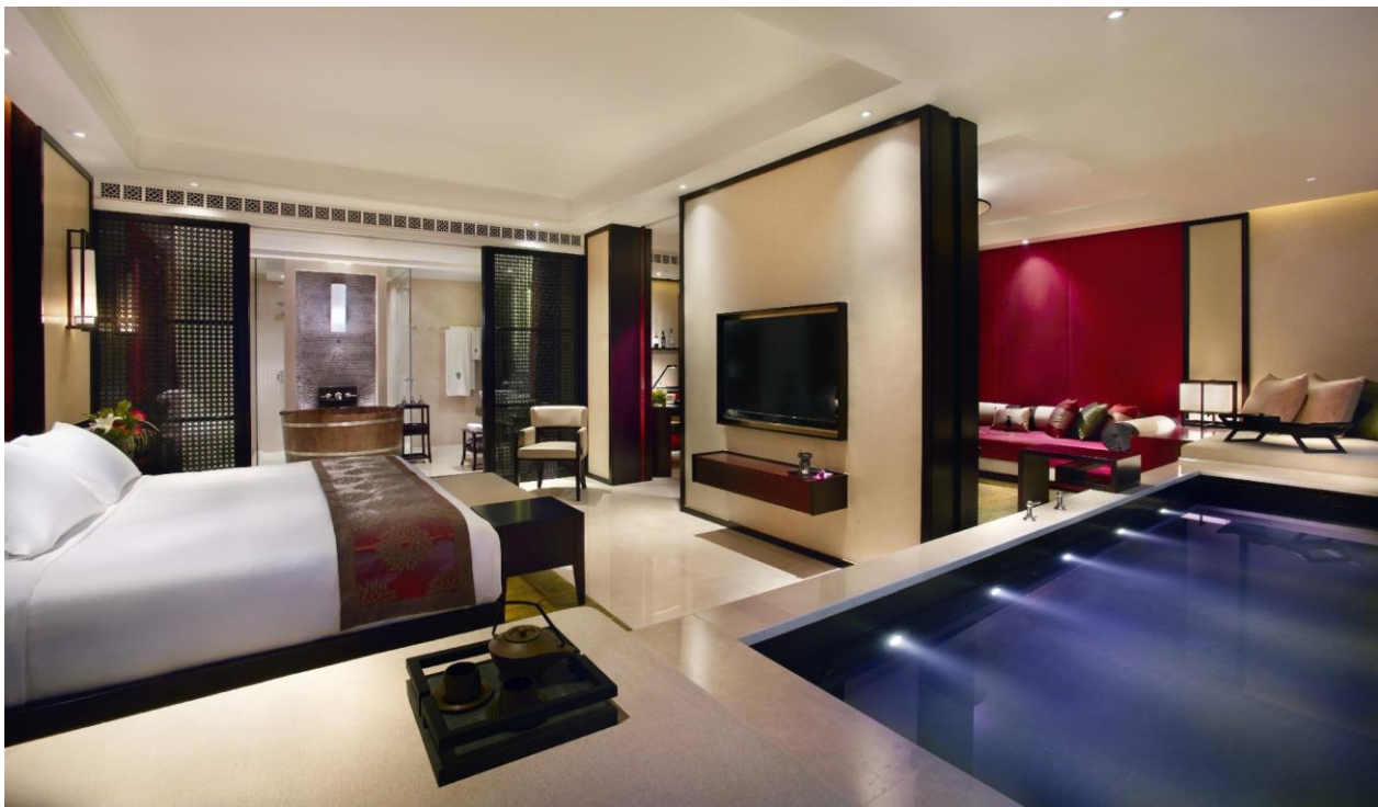
Banyan Tree Macau