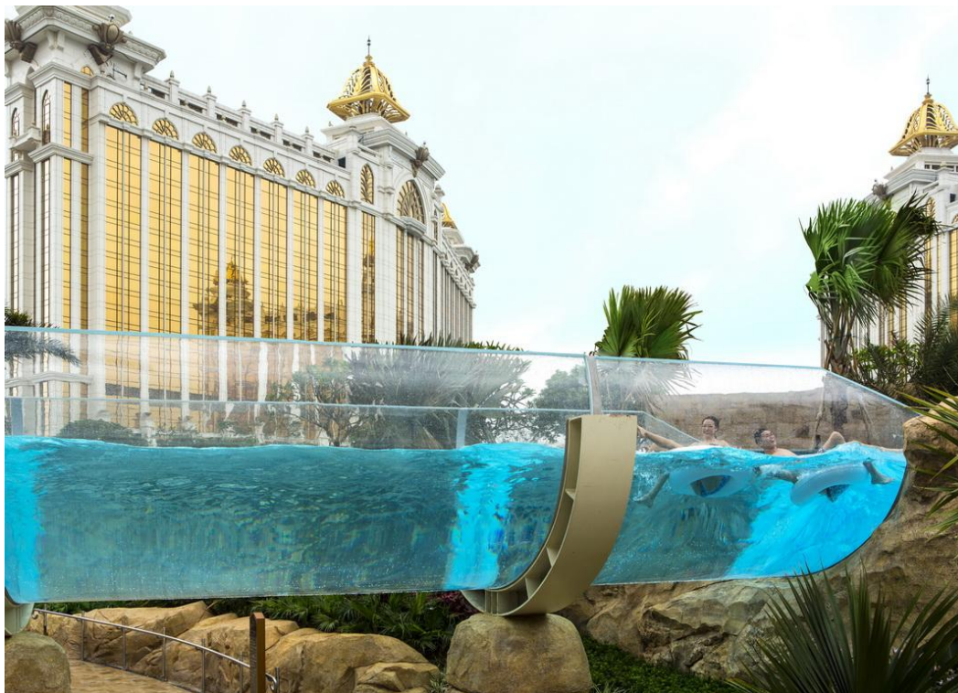
Grand Resort Deck in Galaxy Macau™