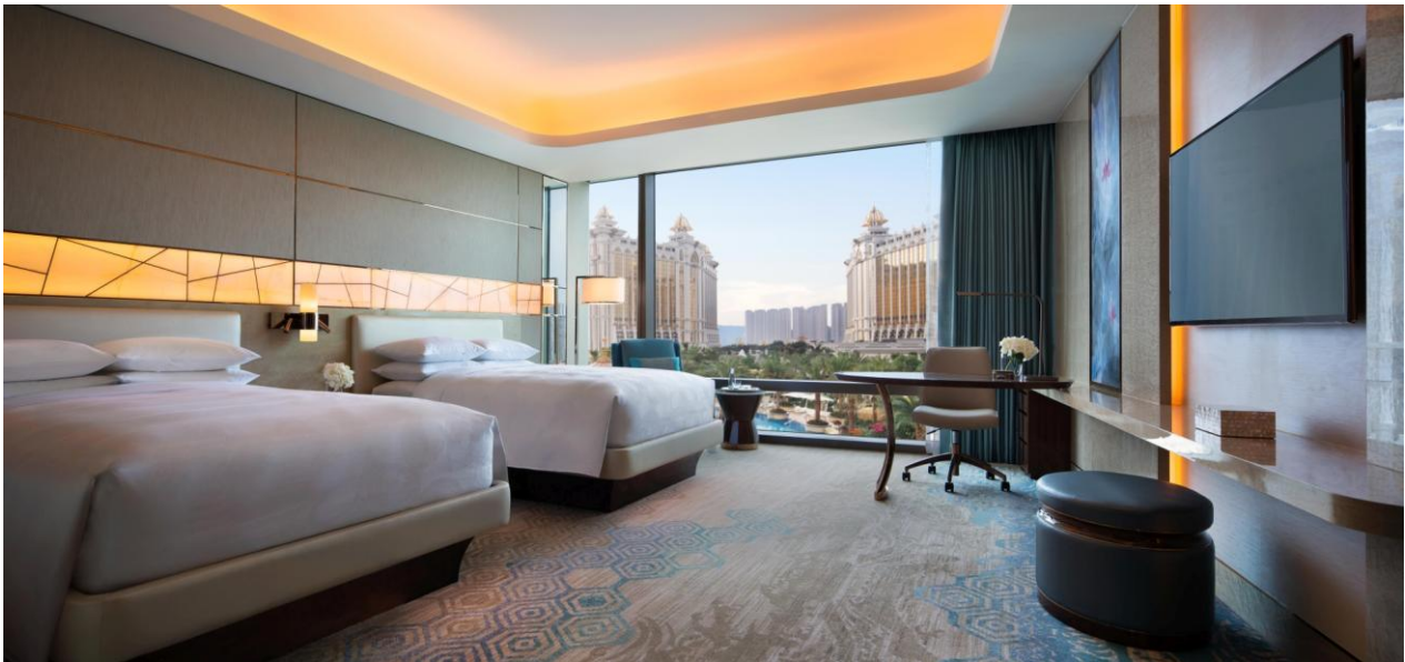
JW Marriott Hotel Macau

K. Wah Group Celebrates 60th Anniversary with Fabulous Prizes Sponsored by Galaxy Entertainment Group A 60-Day Quiz Contest to Win 60 Macau Luxury Accommodation 23 December 2015