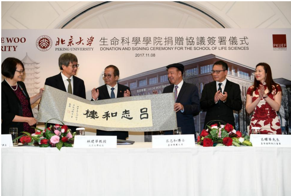
Photo 11: Dr Lui Che-woo (the 3 rd one from the right), Chairman of K. Wah Group, has specially written a Chinese Calligraphy for Peking University and wishes the scholars and students at the University every success with their researches for the betterment of mankind