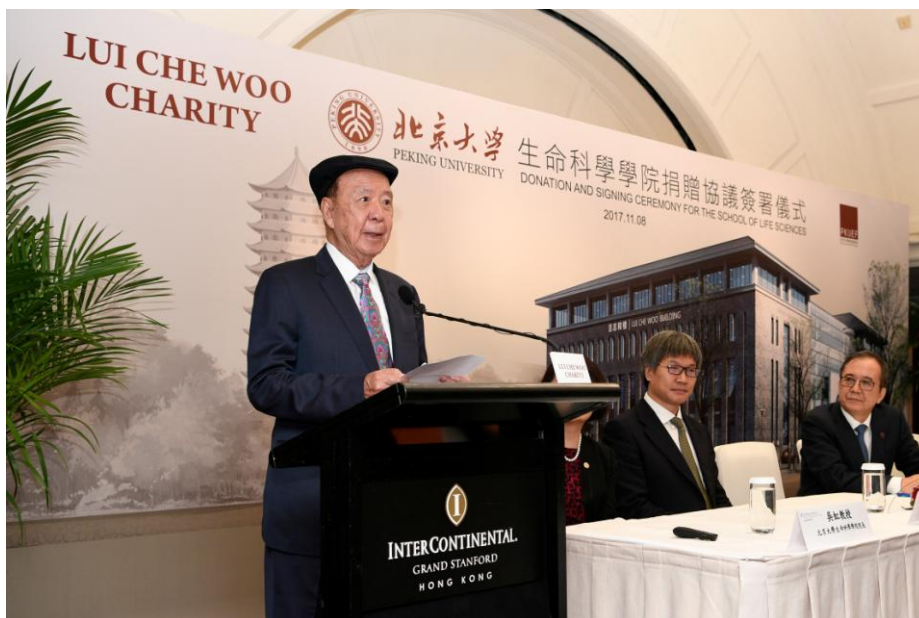
Photo 1: Dr Lui Che-woo, Chairman of K. Wah Group and Director of Lui Che Woo Charity