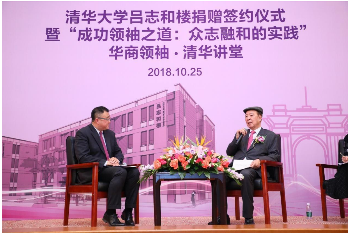
Photo 8: Around 150 Tsinghua faculty members and students attended the “Inclusivity in Diversity” symposium